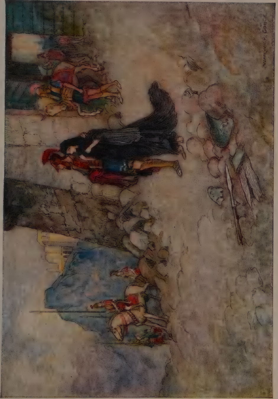
CRISEYDE LEAVING TROY